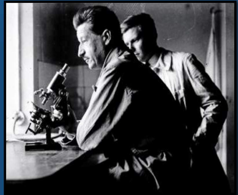
Figure 1 A picture of Edmond Locard

Locard formulated the basic principle: “Whenever two objects come into contact with one another, there is an exchange of materials between them,” or simply “Every contact leaves a trace,” now known as Locard's Exchange Principle.