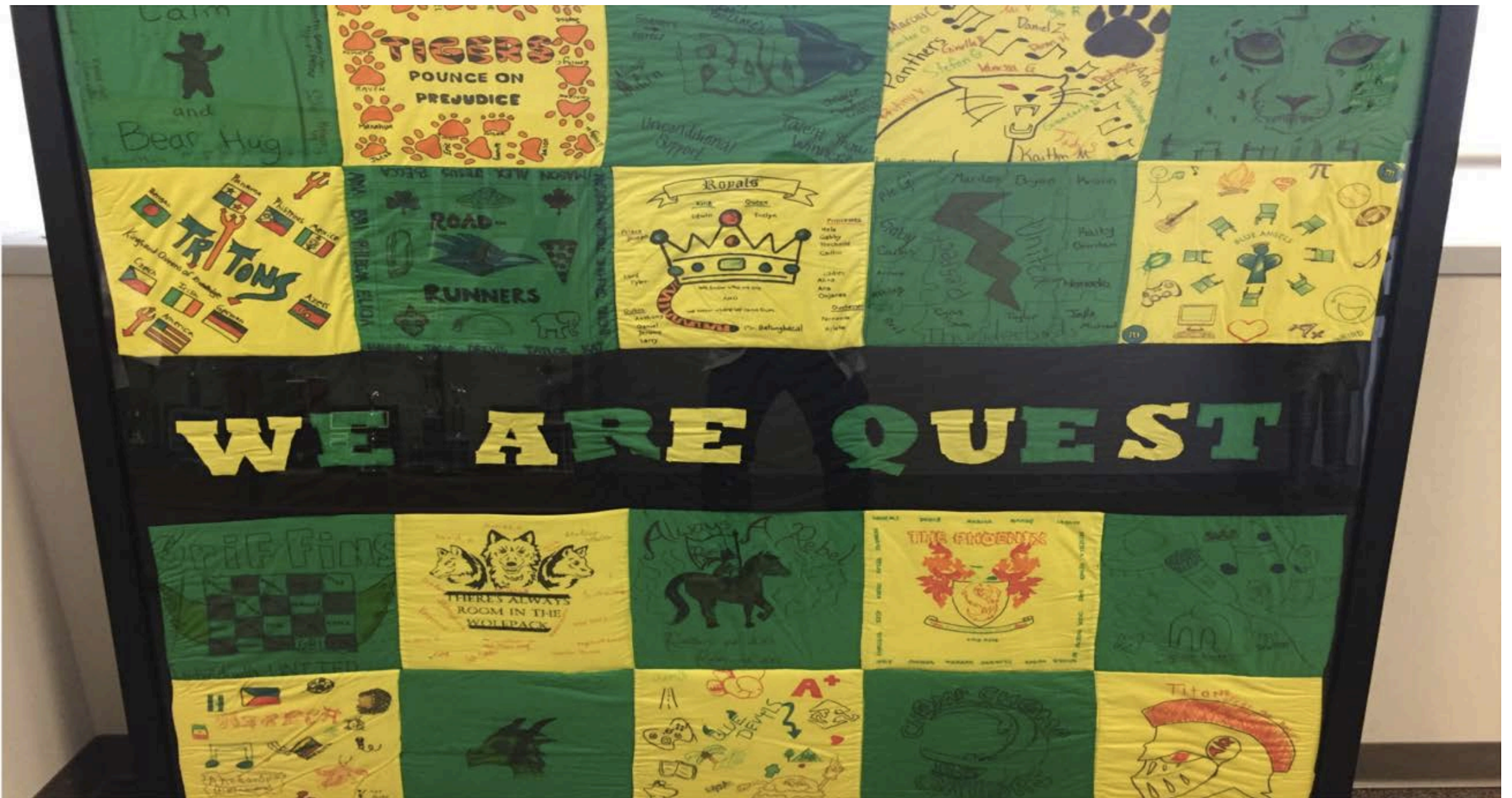
TEXAS EARLY COLLEGE HIGH SCHOOL